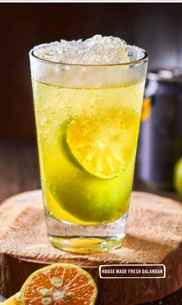
HOUSE MADE FRESH DALANDAN