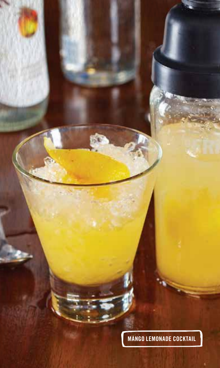
MANGO LEMONADE COCKTAIL