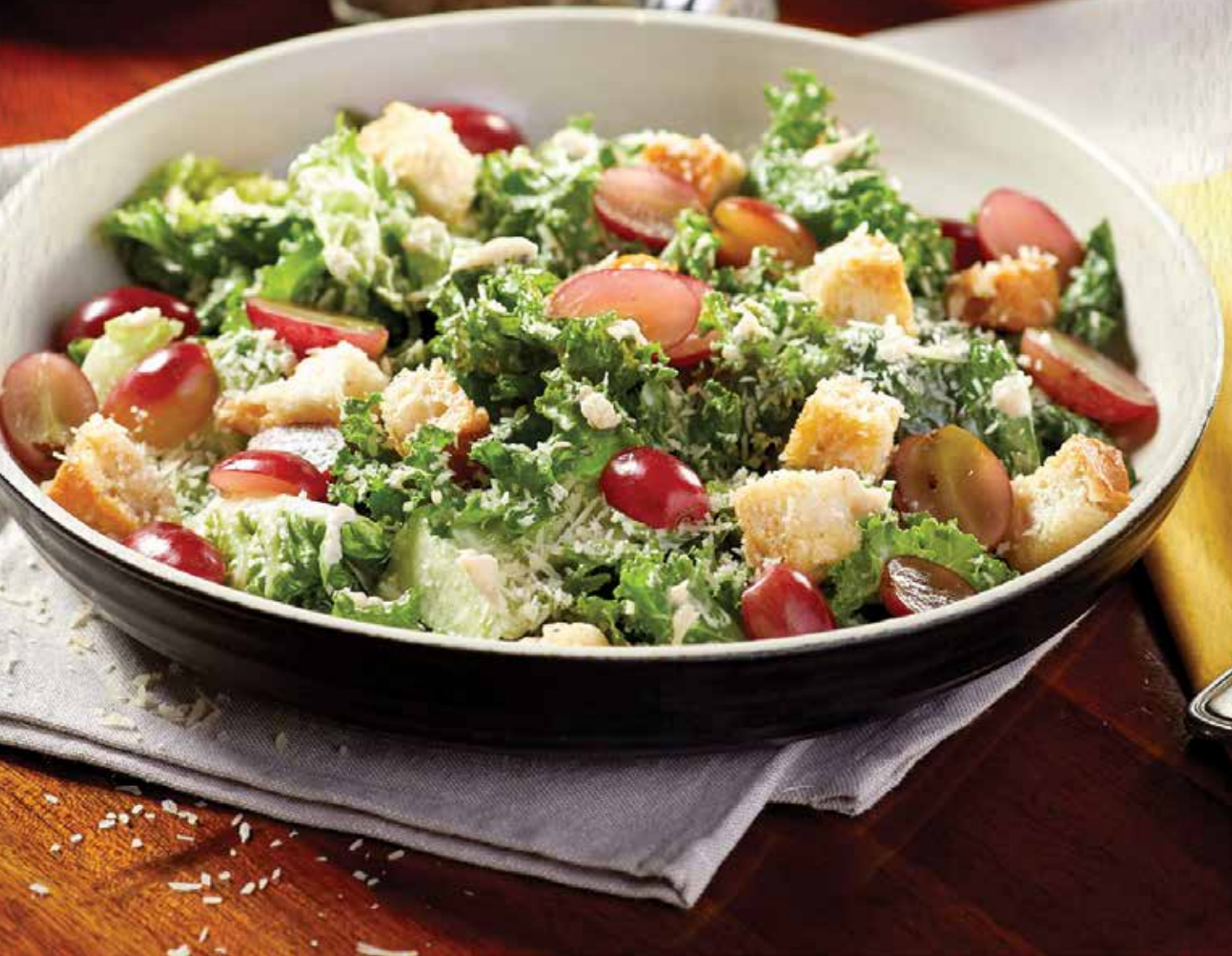
ORIENTAL SESAME SALAD