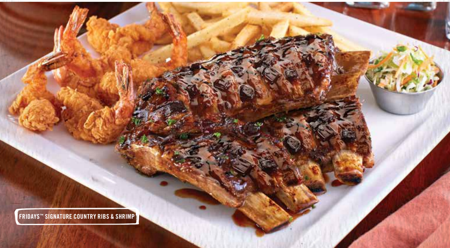
FRIDAYS™ SIGNATURE COUNTRY RIBS & SHRIMP