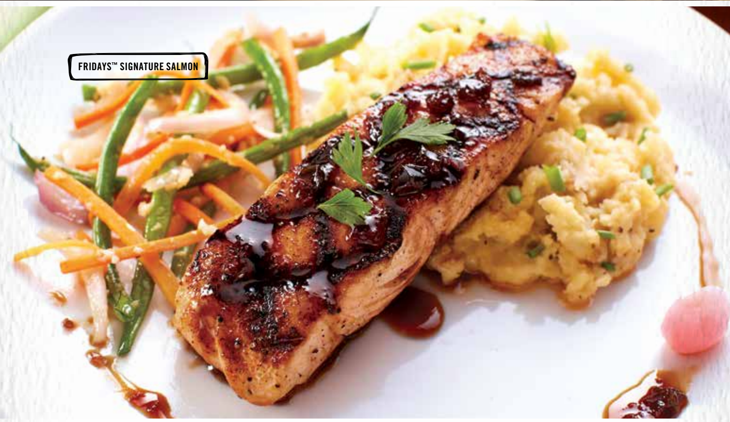
FRIDAYS™ SIGNATURE SALMON