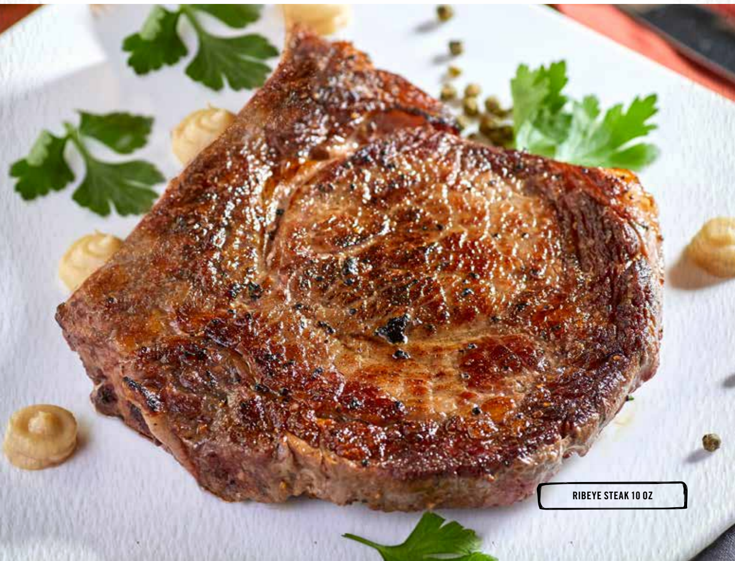
RIBEYE STEAK 10 OZ