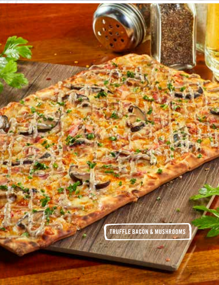
TRUFFLE BACON & MUSHROOMS