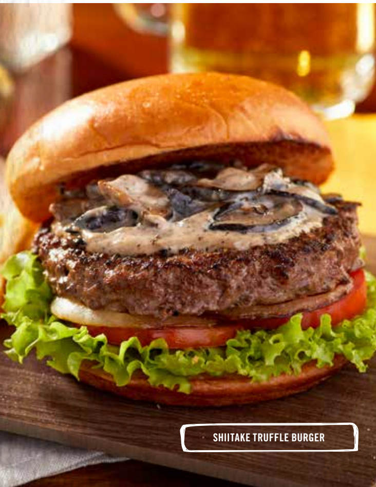
SHIITAKE TRUFFLE BURGER