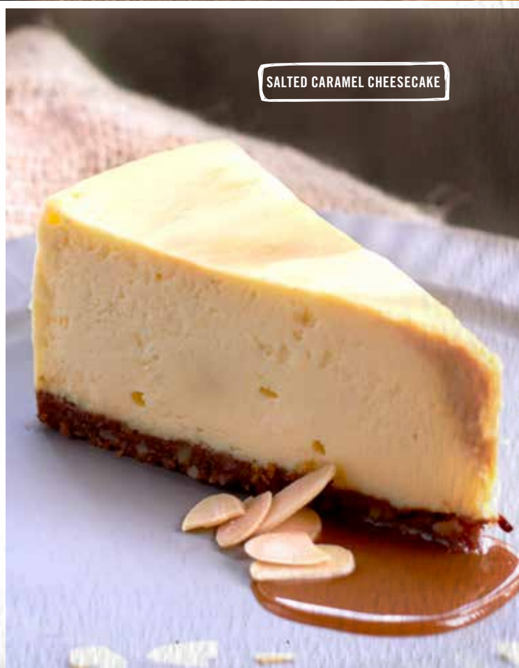
SALTED CARAMEL CHEESECAKE