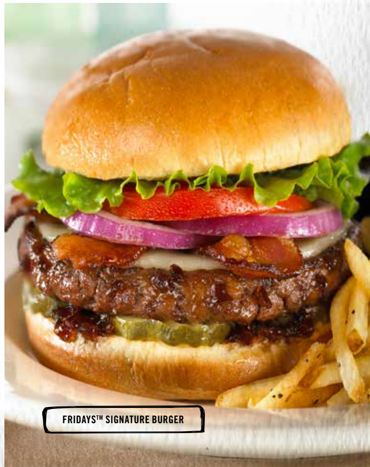
FRIDAYS™ SIGNATURE BURGER