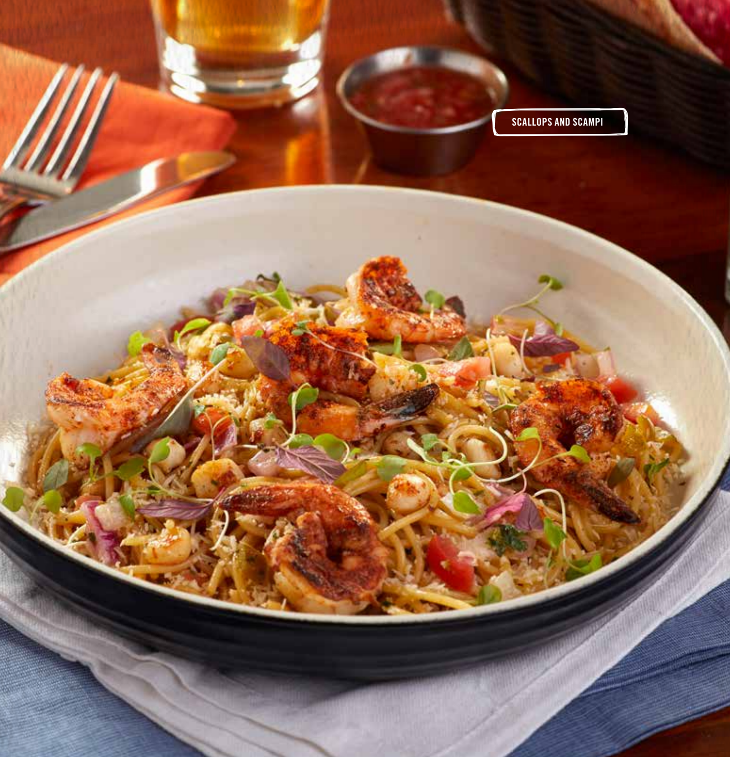
SCALLOPS AND SCAMPI