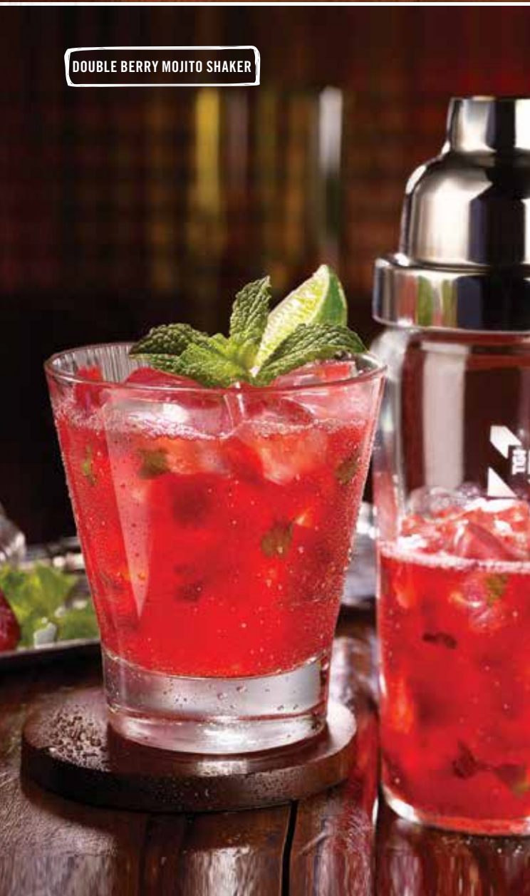
DOUBLE BERRY MOJITO SHAKER