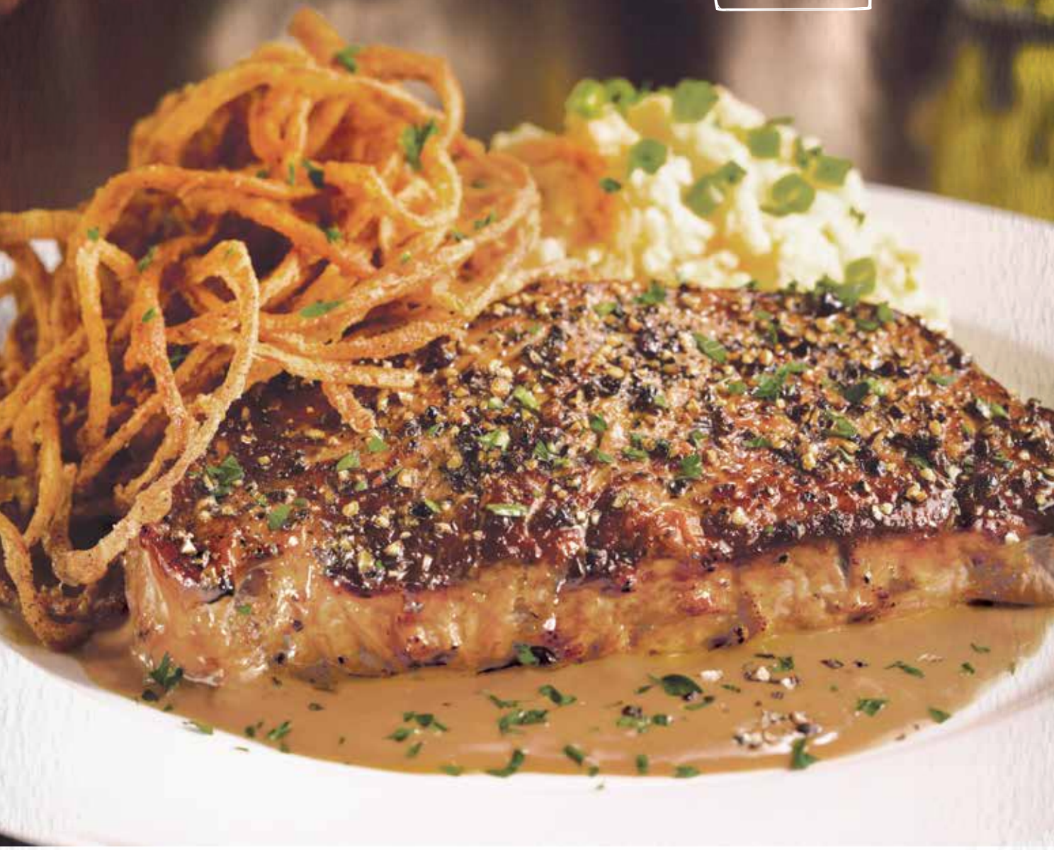
NEW YORK STRIP STEAK