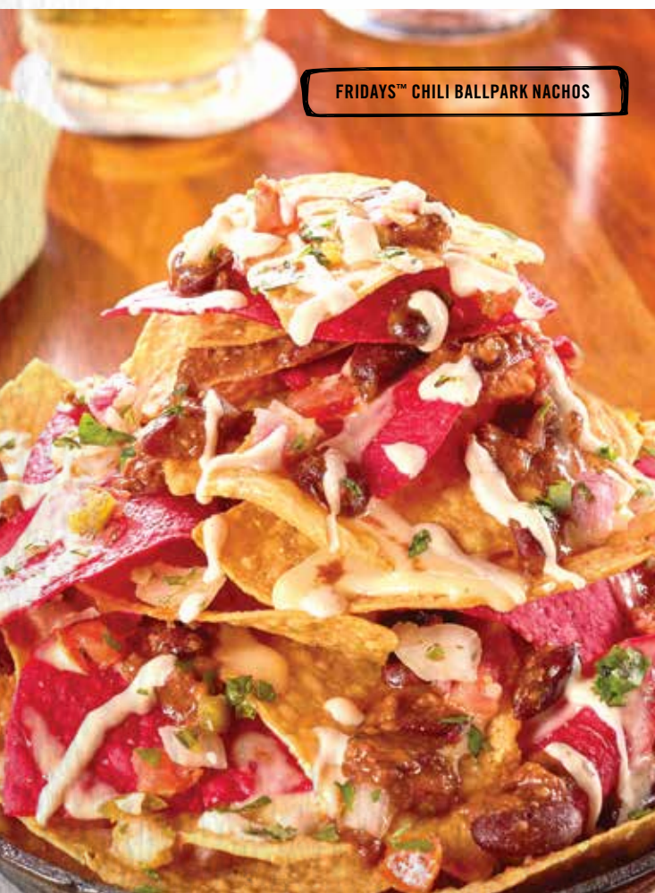
FRIDAYS™ CHILI BALLPARK NACHOS