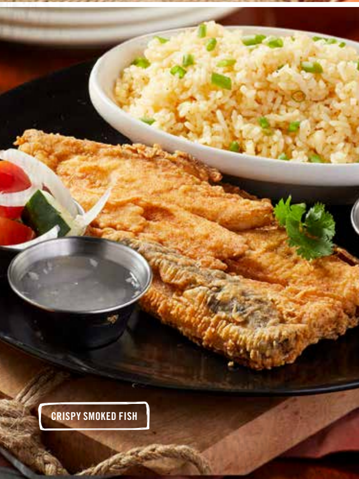
CRISPY SMOKED FISH