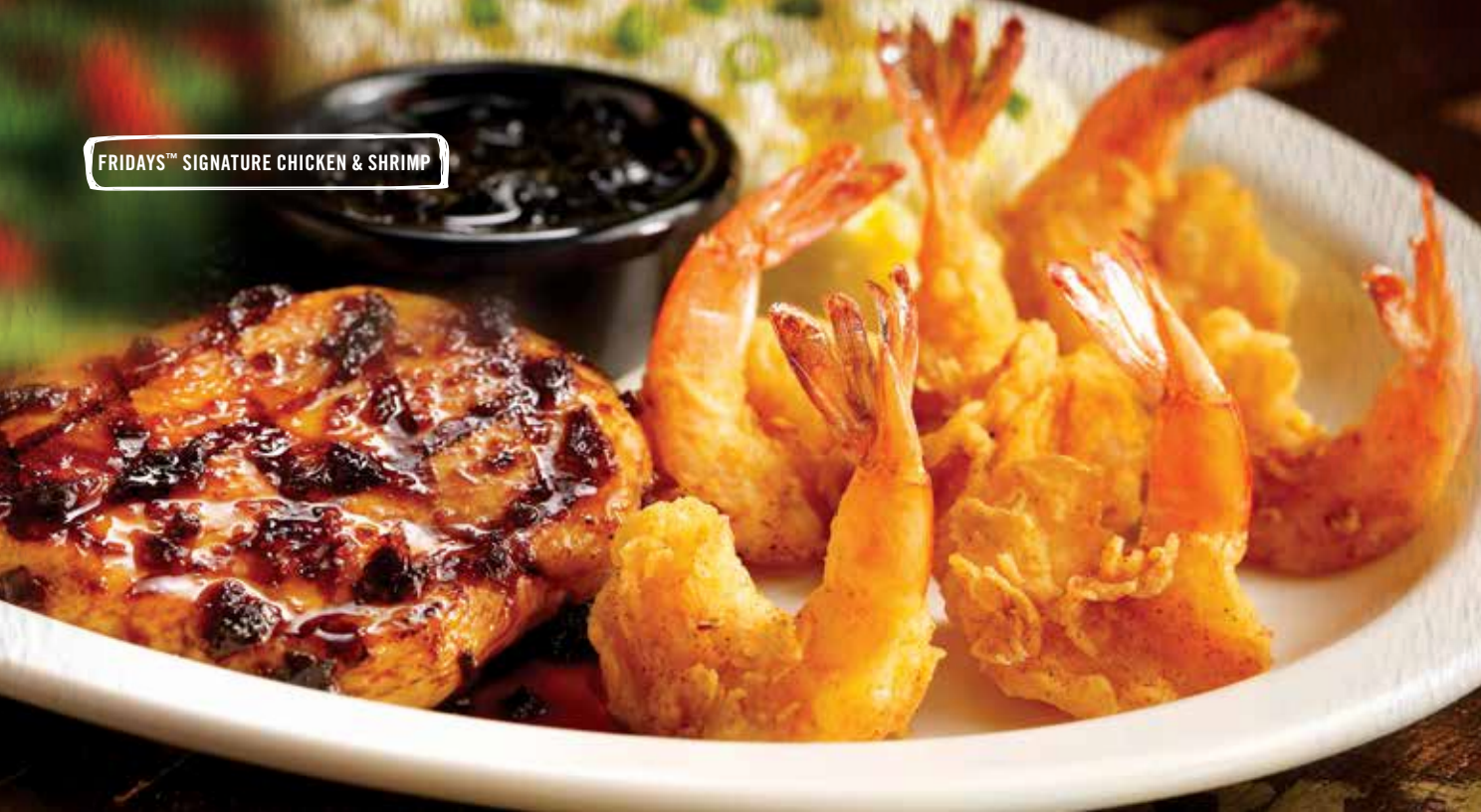
FRIDAYS™ SIGNATURE CHICKEN & SHRIMP