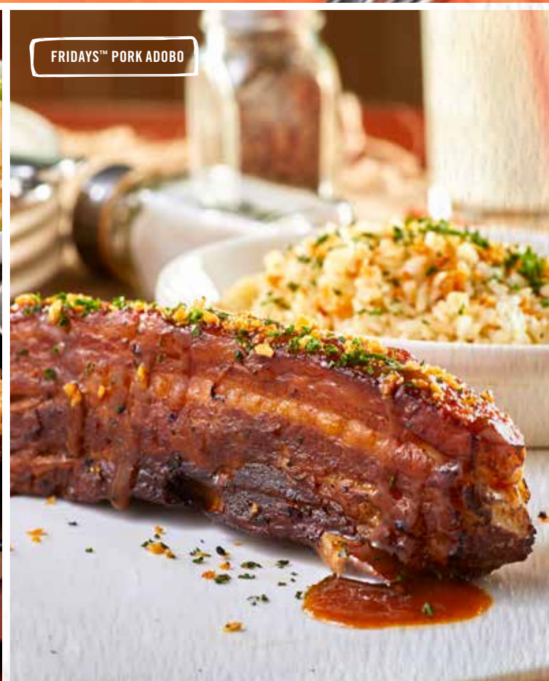
FRIDAYS™ PORK ADOBO