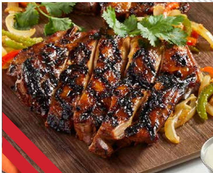
» GRILLED BBQ CHICKEN