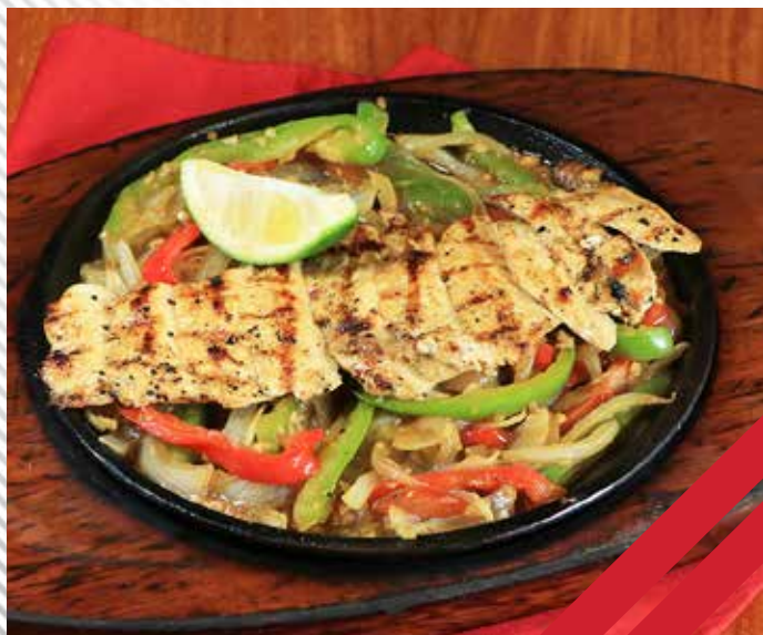
» SIZZLIN' CHICKEN FAJITAS