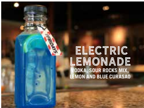
ELECTRIC LEMONADE VODKA, SOUR ROCKS MIX, LEMON AND BLUE CURASAO