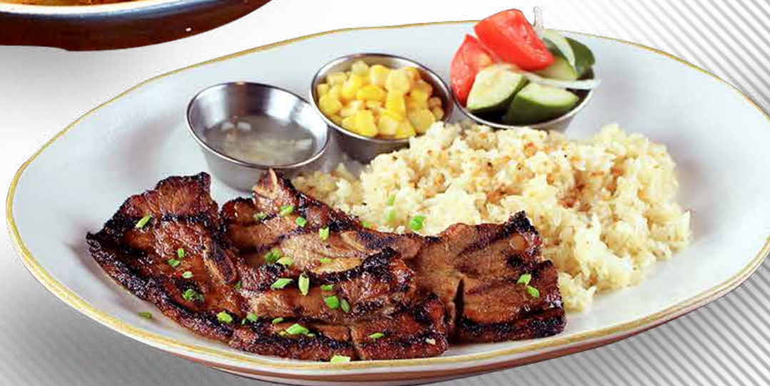
» FRIDAYS REGULAR LIEMPO