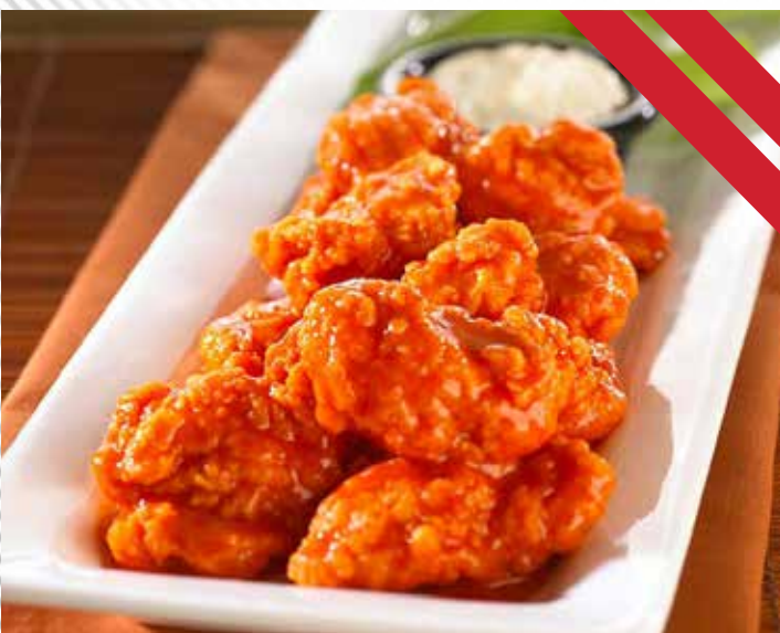
» BONELESS BUFFALO BITES