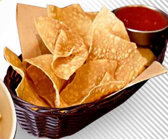
» CHIPS & SALSA