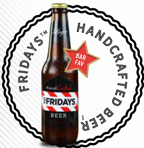
Hand Crafted Beer P275

White Rice Php 60 Garlic Rice Php 75 Cheddar Mashed Potato Php 125