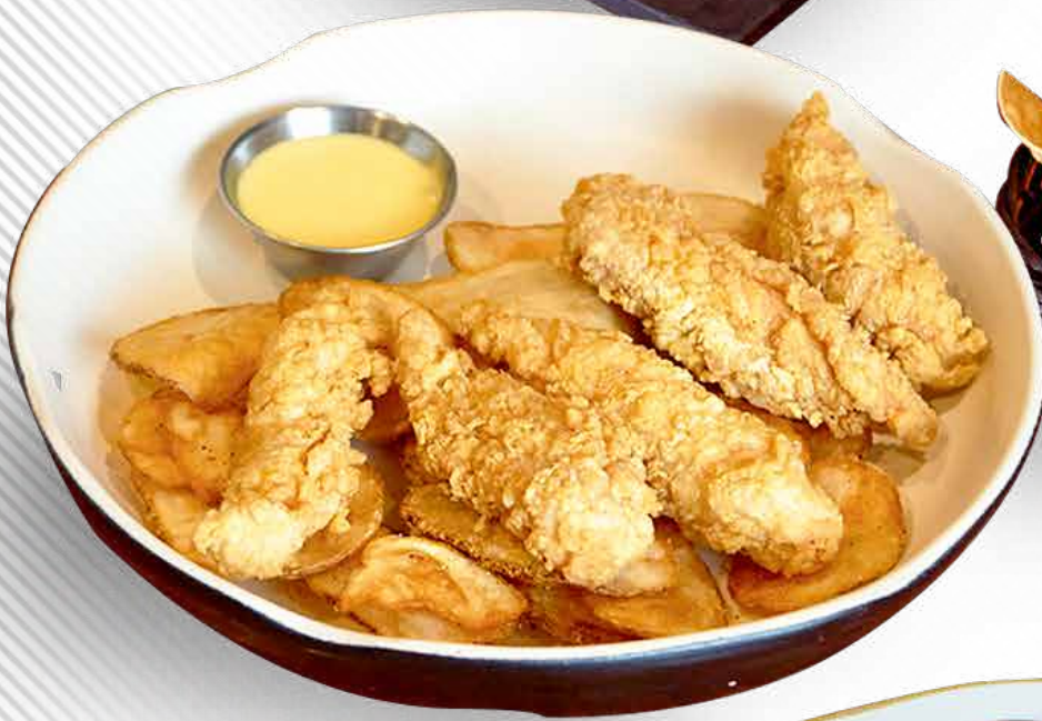
» CHICKEN FINGERS