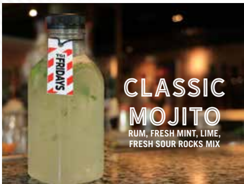
CLASSIC MOJITO RUM, FRESH MINT, LIME, FRESH SOUR ROCKS MIX