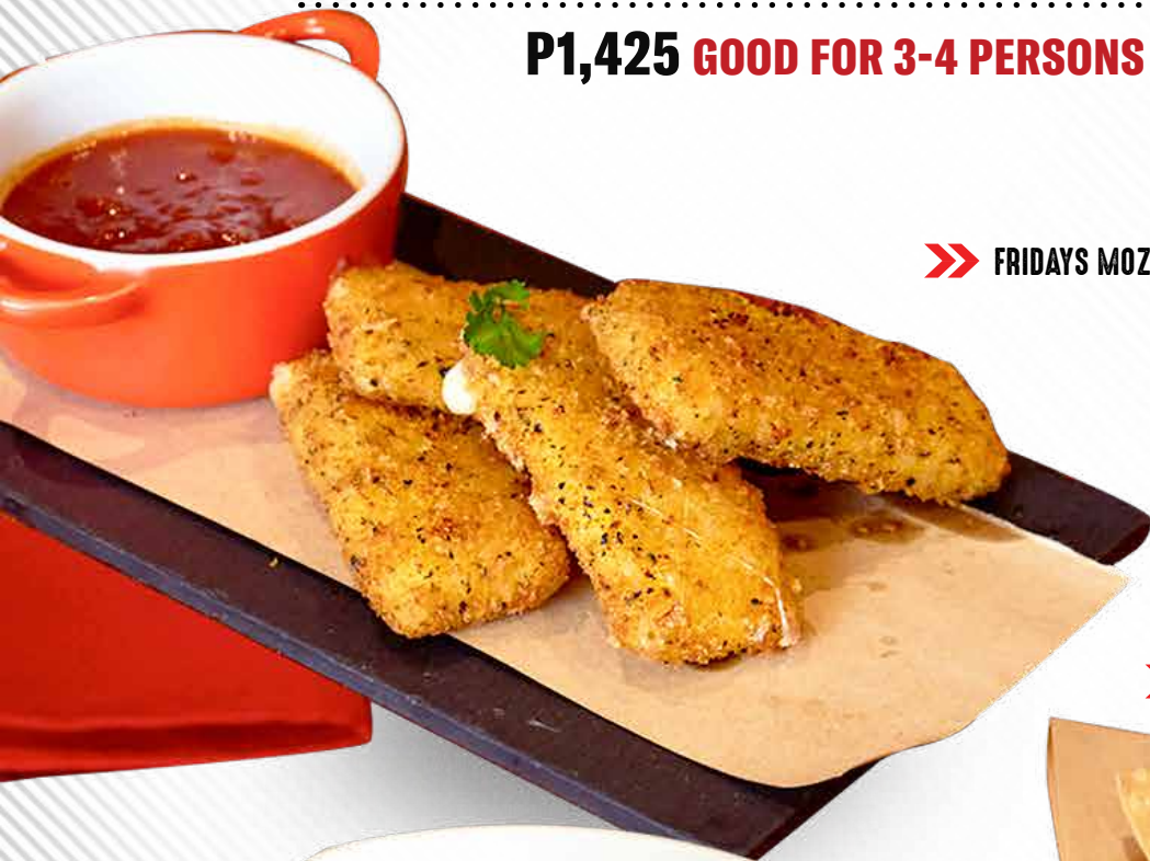
» FRIDAYS MOZZARELLA