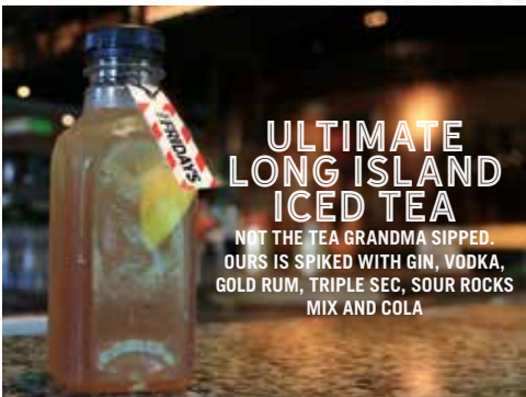
ULTIMATE LONG ISLAND ICED TEA NOT THE TEA GRANDMA SIPPED. OURS IS SPIKED WITH GIN, VODKA, GOLD RUM, TRIPLE SEC, SOUR ROCKS MIX AND COLA