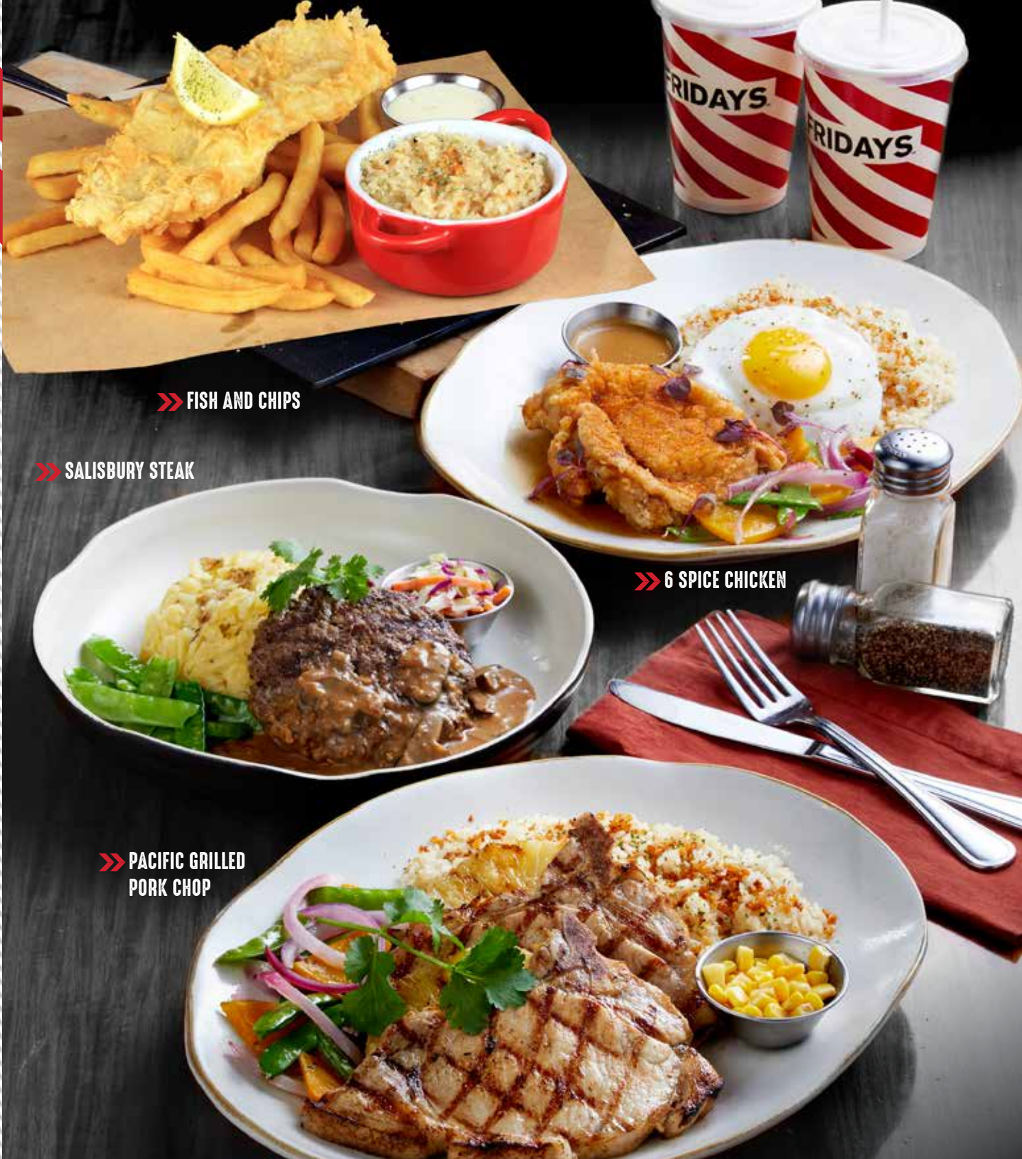
» FISH AND CHIPS