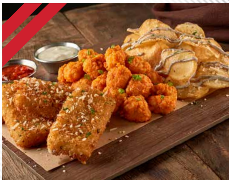
» FRIDAYS TRIO