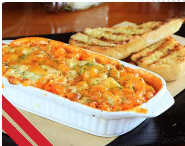
» BAKED MAC AND CHEESE