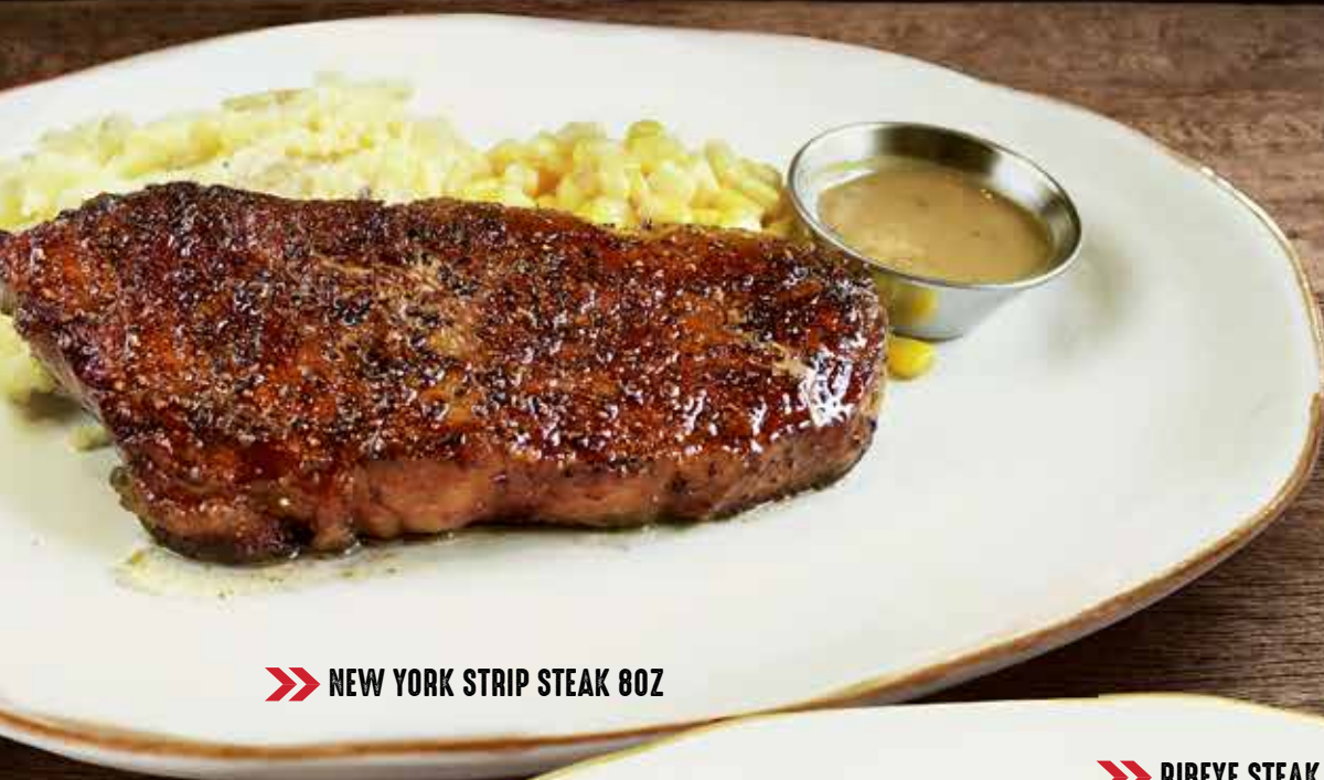
»» NEW YORK STRIP STEAK 8OZ