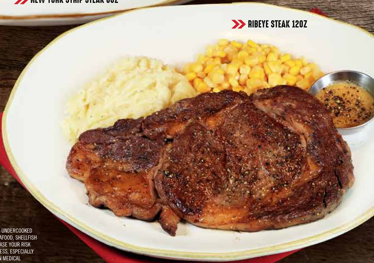
»» RIBEYE STEAK 12OZ

CONSUMING RAW OR UNDERCOOKED MEATS, POULTRY, SEAFOOD, SHELLFISH OR EGGS MAY INCREASE YOUR RISK OF FOODBORNE ILLNESS, ESPECIALLY IF YOU HAVE CERTAIN MEDICAL CONDITIONS. OUR DISHES ARE COOKED TO ORDER.