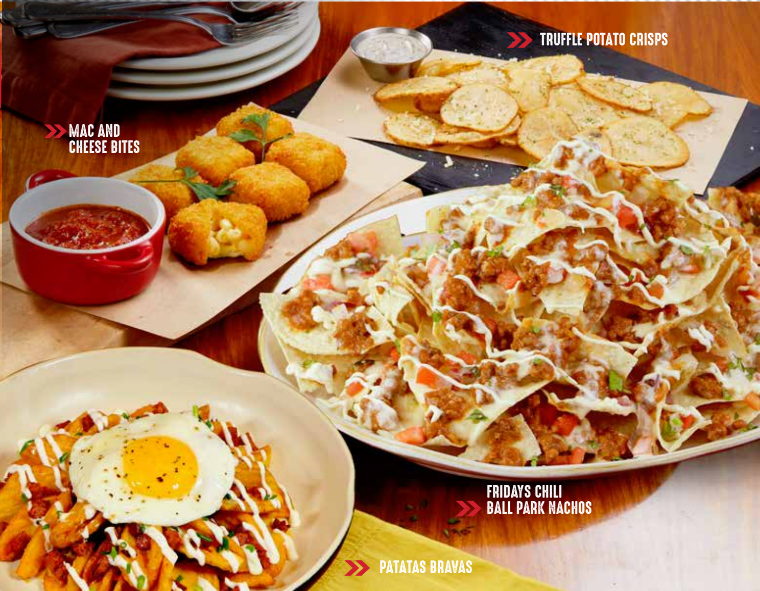
» MAC AND CHEESE BITES