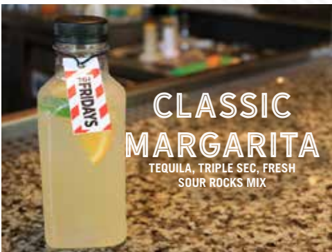
CLASSIC MARGARITA TEQUILA, TRIPLE SEC, FRESH SOUR ROCKS MIX