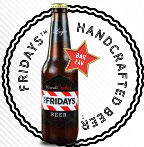
Hand Crafted Beer P275

White Rice Php 60 Garlic Rice Php 75 Cheddar Mashed Potato Php 125