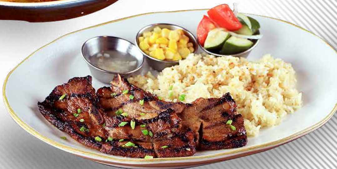
» FRIDAYS REGULAR LIEMPO