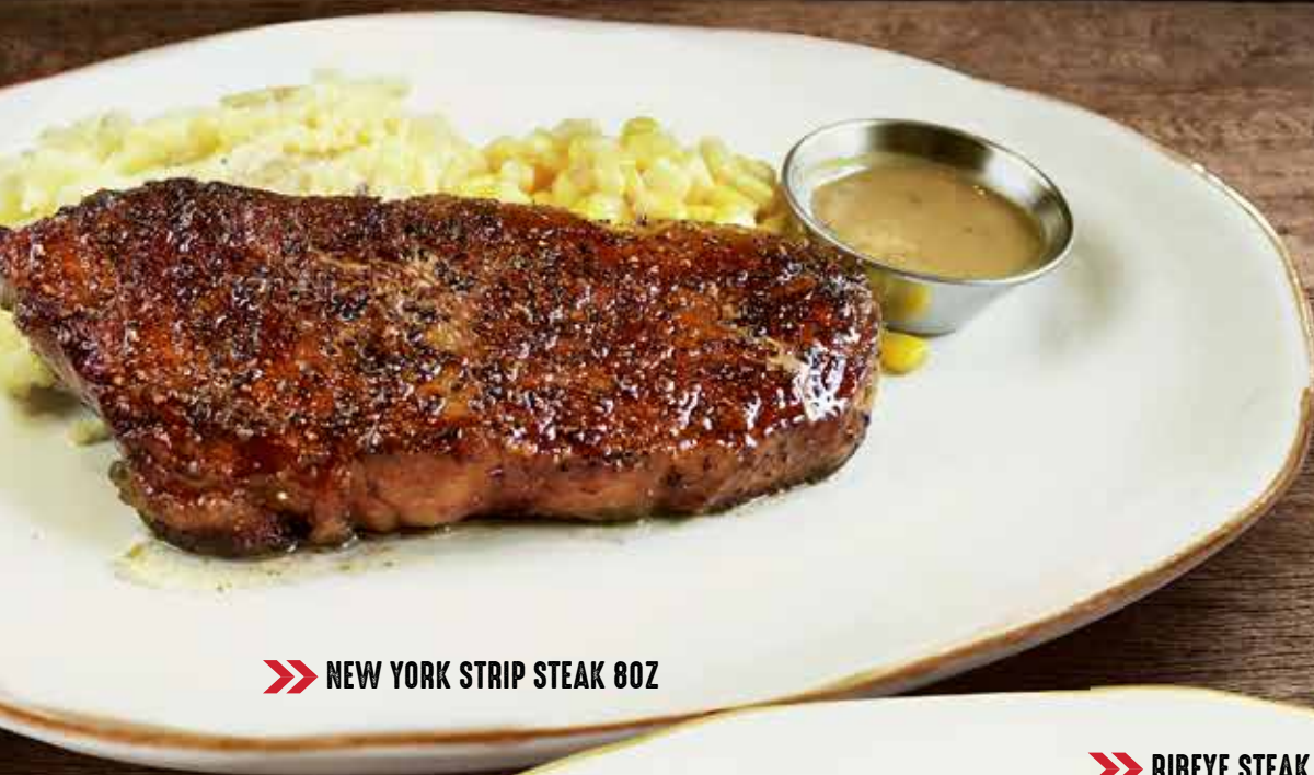
»» NEW YORK STRIP STEAK 8OZ